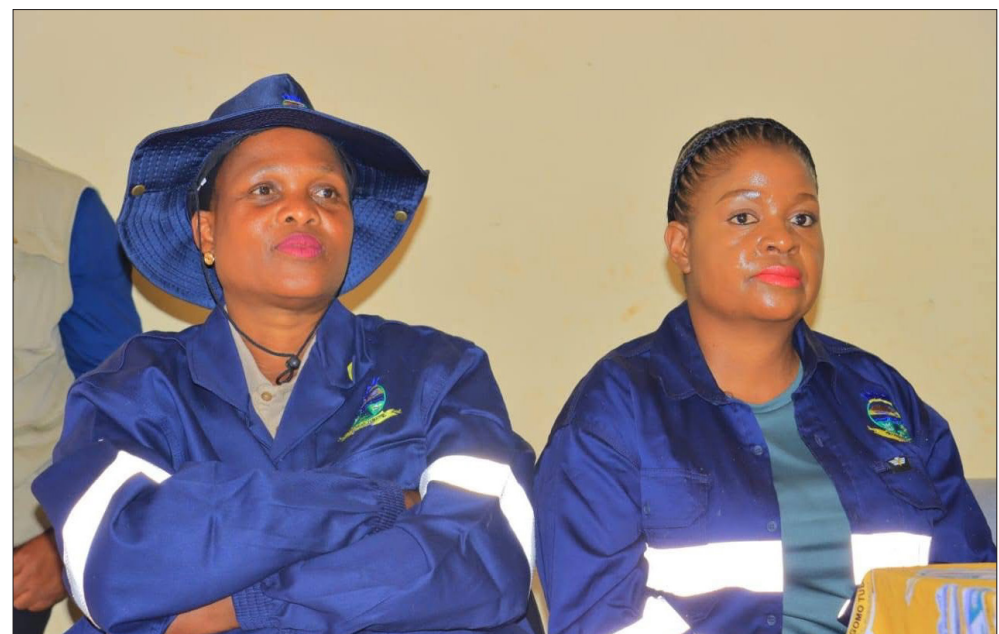
Fetakgomo Tubatse councillors.

“ We are sick and tired about individuals collapsing service delivery projects. Gone are the days we will allow people to disrupt services delivery projects in our communities. I put my neck on the block, I will be in these projects day and night to ensure no one disrupts them. ”