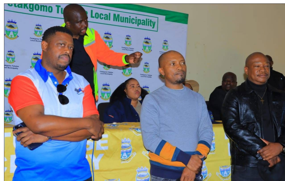
Two contractors for a 6 kilometre access road at Ga-Mokgotho village.