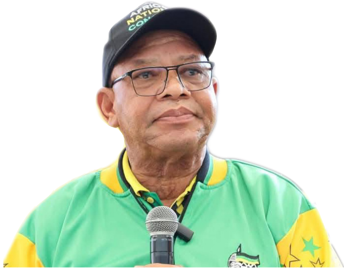
Former Limpopo Premier and current Deputy Minister of Land Reform and Rural Development, Stan Mathabatha, has joined hundreds of young men to undergo a passage to manhood at an initiation school in Tjiane Village, Ga-Mphahlele.

Sizwe, Mathabatha joined the liberation struggle in 1977 and served as Premier of Limpopo from 2013 until June 2024, when he was succeeded by Dr Phophi Ramathuba. Mathabatha follows in the footsteps of other ANC leaders who underwent initiation at older ages, including Fikile Mbalula, who went through initiation at 37 in Phillipi, Cape Town in 2008. His participation marks a symbolic gesture, reaffirming cultural identity and tradition, even in high political ranks.