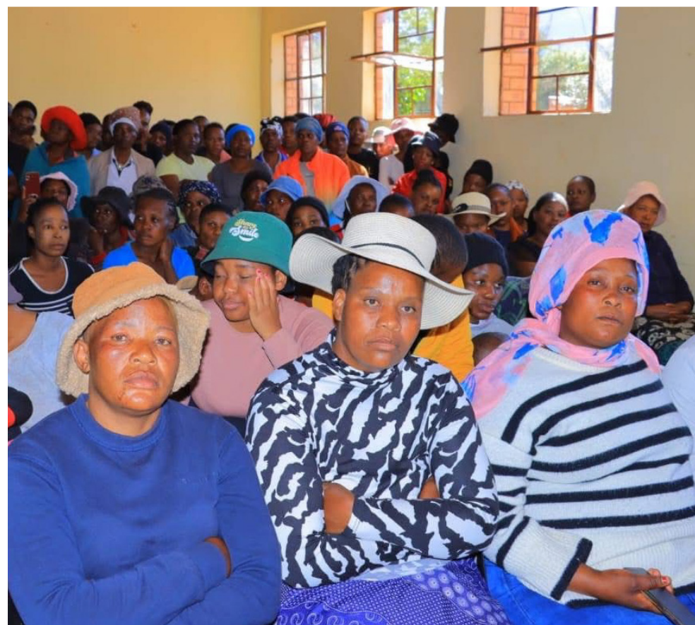
Ga Mokgotho community members.

“ We are sick and tired about individuals collapsing service delivery projects. Gone are the days we will allow people to disrupt services delivery projects in our communities. I put my neck on the block, I will be in these projects day and night to ensure no one disrupts them. ”