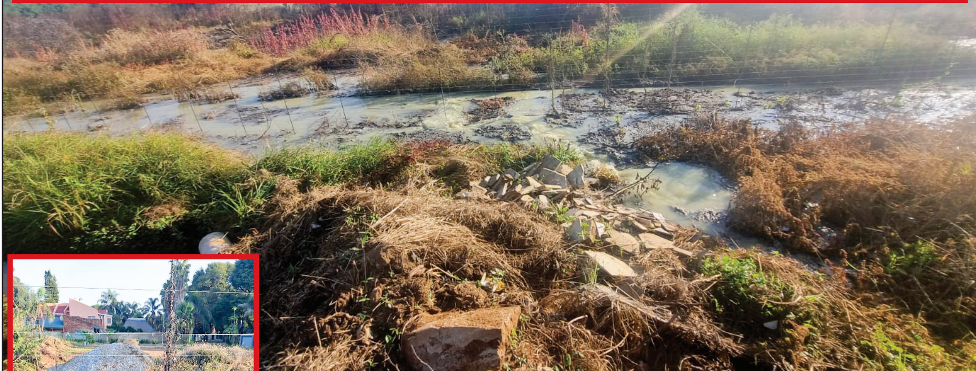
Raw waste sewage potentially flowing into river and spills flooding residential properties in Marble Hall.