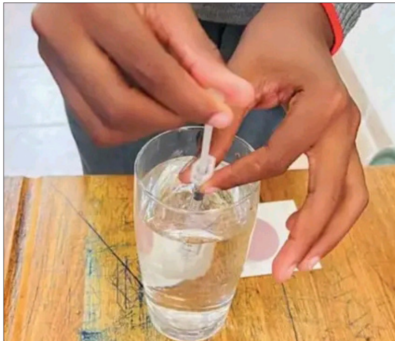
The DA in Limpopo is urging the Education Department to regularly conduct water testing in schools following a shocking contamination discovery made by WaterCAN in a recent School Water Quality Testing Project.