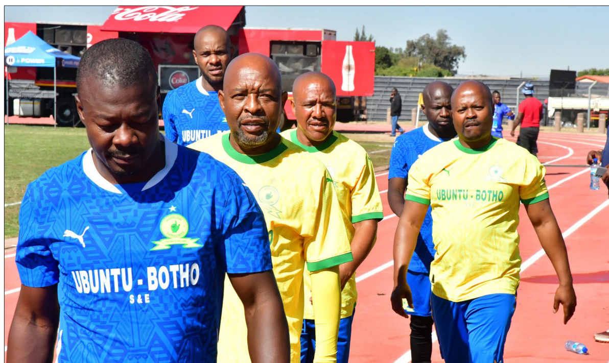
Mamelodi Sundowns Legends squad was defeated 3-0 by Orlando Pirates in the final game.