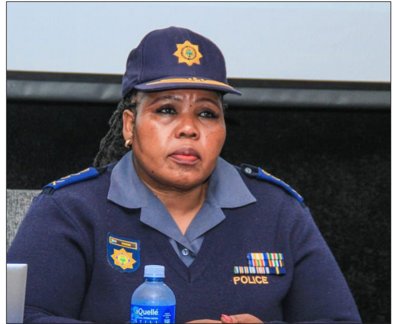
Limpopo Provincial Police Commissioner, Lieutenant General Thembi Hadebe, has ordered a dedicated task team to investigate and track down suspects involved in the robbery of firearms and ammunition at a farm in Burgersfort

"The illegal possession of firearms by criminals remains a major threat to public safety. We will not rest until these dangerous individuals are apprehended and the stolen weapons recovered," said Hadebe.