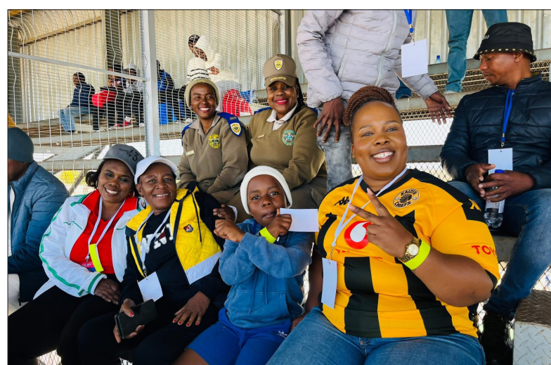
Supporters from different parts of the country came in numbers to support their teams during the highly anticipated Top 4 Legends Soccer Tournament, organised at Kameelrivier Stadium outside Siyabuswa.